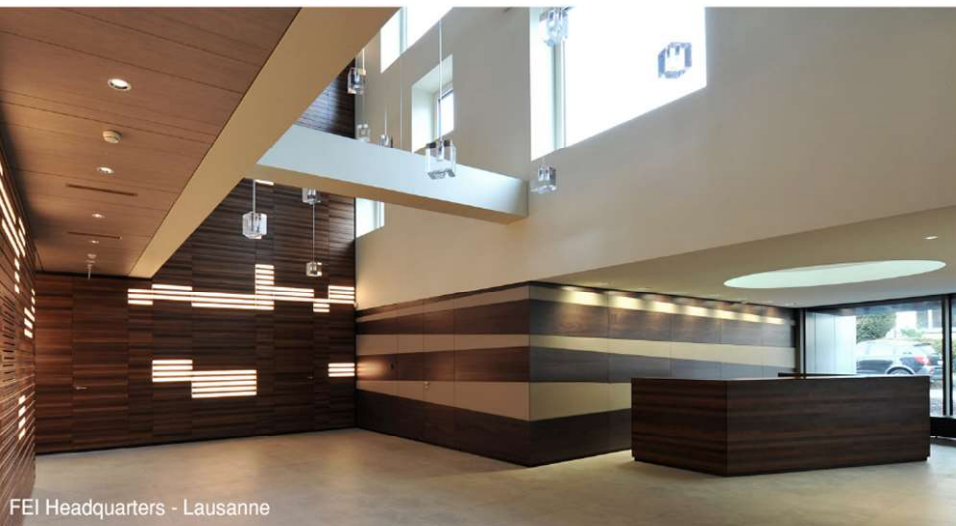
FEI Headquarters - Lausanne