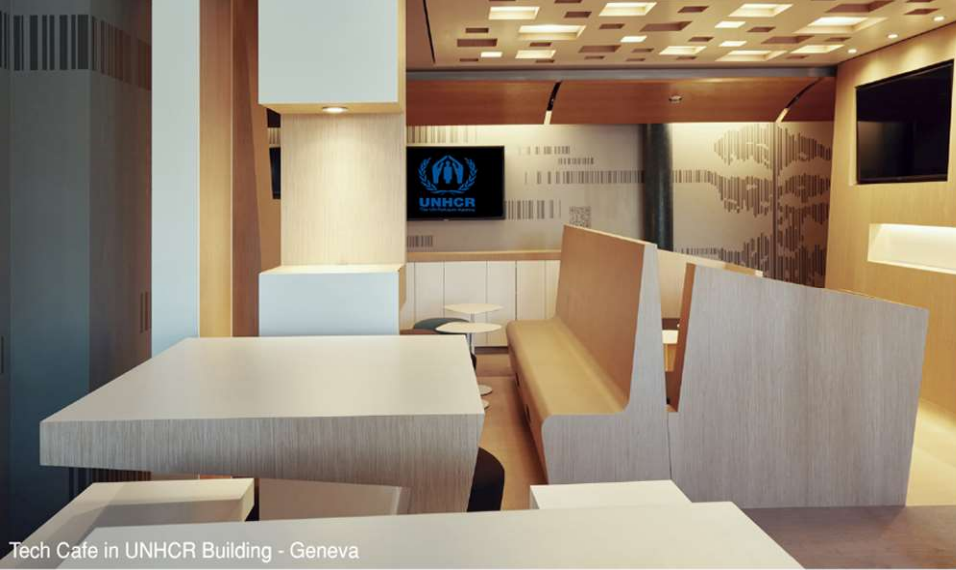
Tech Cafe in UNHCR Building - Geneva