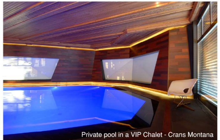
Private pool in a VIP Chalet - Crans Montana