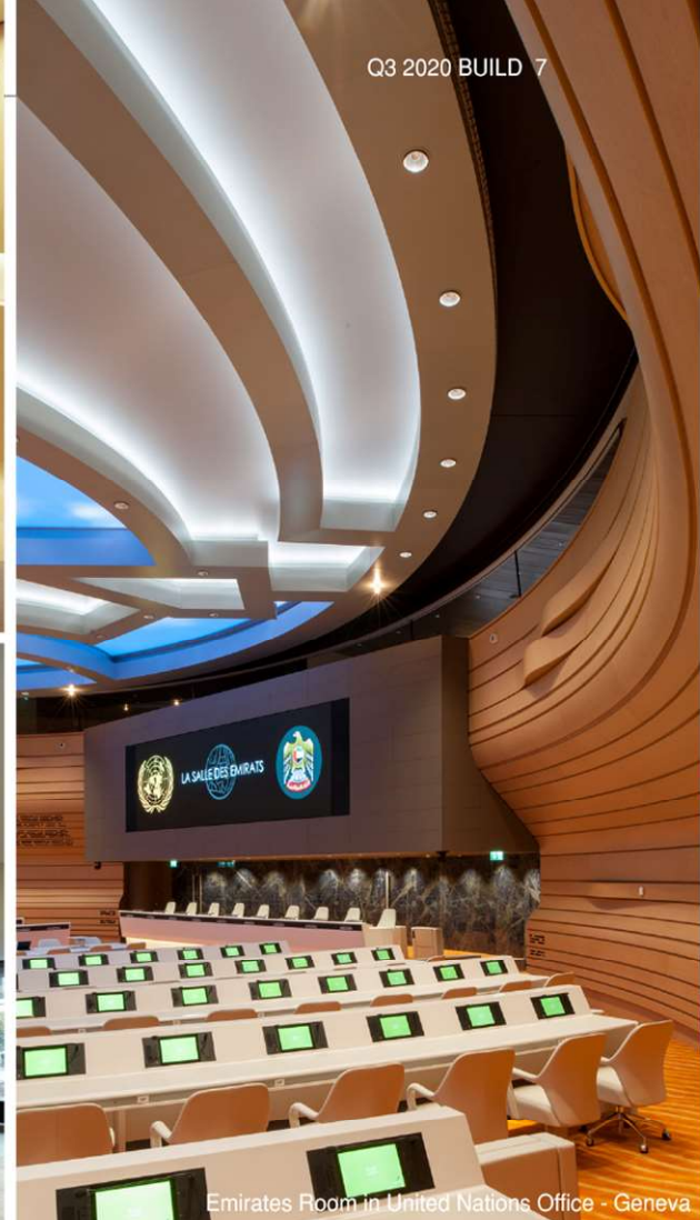
Emirates Room in United Nations Office - Geneva

with the best in the business to guarantee excellence for his clients and their projects. Not only does partnering with the best companies in the business guarantee excellence in the finished space, but also in the finest details of the work away from the space, such as how they approach an expected budget or time constraints.