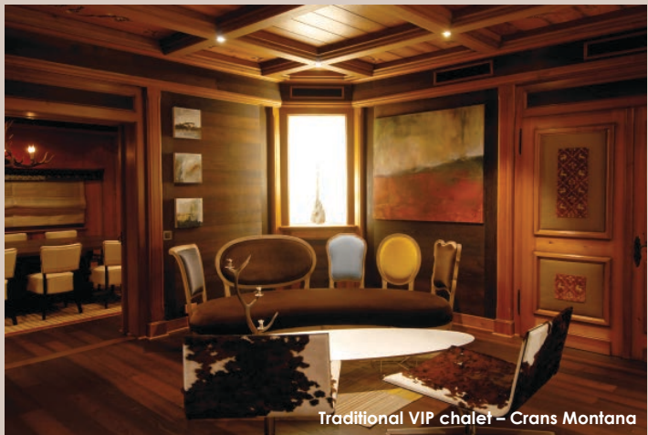
Traditional VIP chalet – Crans Montana

The new FEI Headquarters Building is called the HM King Hussein I Building. The latter is realized in accordance with the specifications of Swiss MINERGIE®, a construction standard for environmental responsibility which is in line with the FEI's constant efforts. The project has been accomplished in collaboration with KCA London & H. de Rhame Architects