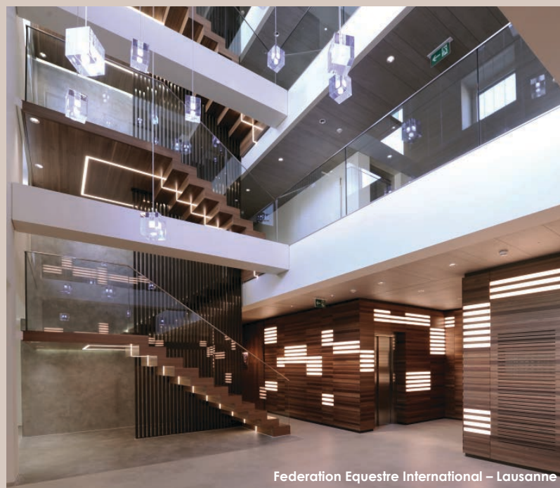
Federation Equestre Internationale – Lausanne