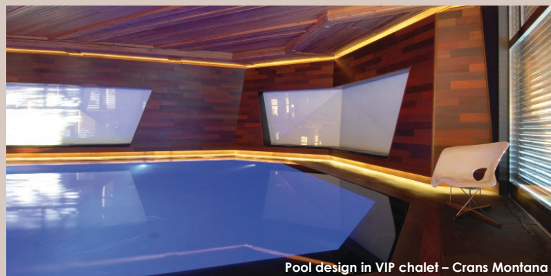
Pool design in VIP chalet – Crans Montana

ADELI INTERIOR ARCHITECTURE & PARTNERS LTD